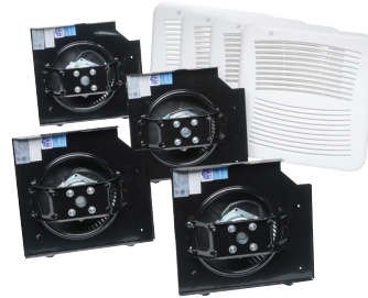
Motor & Grille Pack